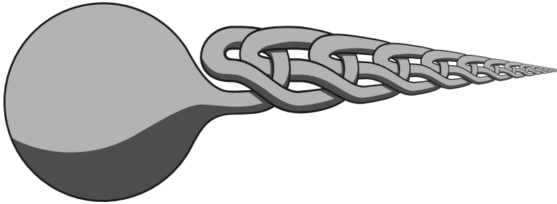
Figure 3: The Fox-Artin sphere

However, as in the Alexander horned sphere, the interior component together with the sphere yield a subset homeomorphic to a closed ball.