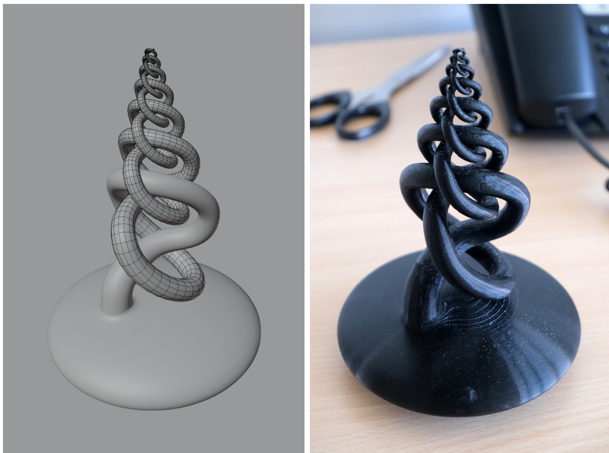
Figure 4: 3D model and 3D printed sculpture of the Fox-Artin sphere

The files used in this article can be freely accessed on http://lugri.net/maths/wildspheres.php .